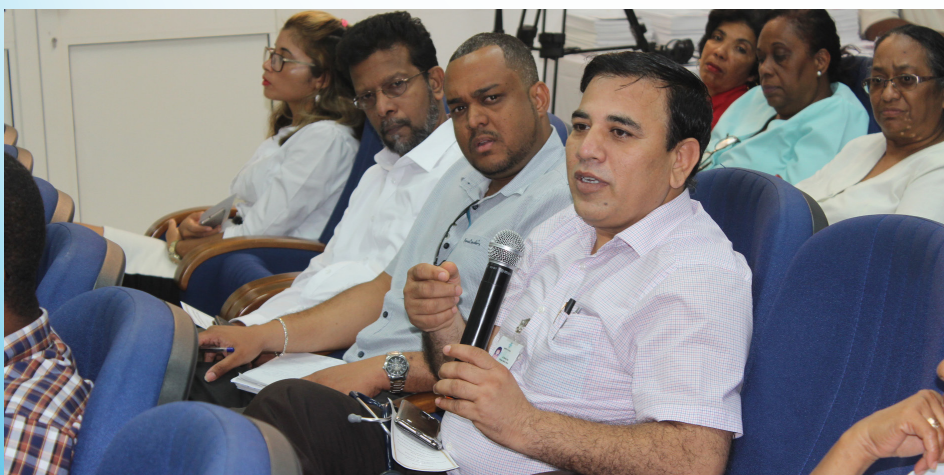
A poignant debate ensued the presentations