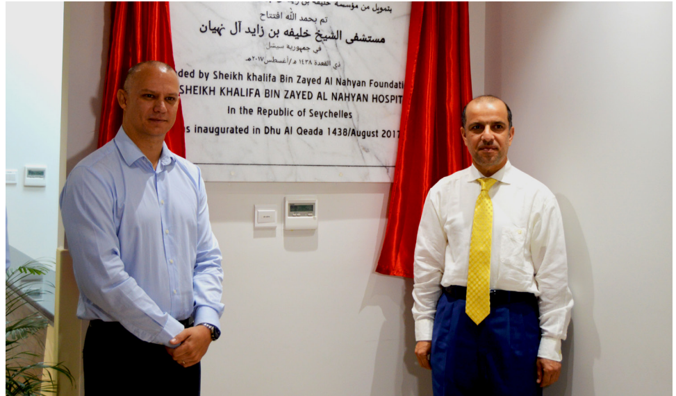
Unveiling of the plaque at the hospital

The Foundation took charge of the construction of the hospital last year. It has 2 operating theatres, seven consultation rooms and several