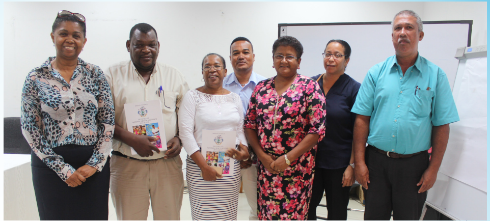
The national health accounts team worked hard to gather the end results