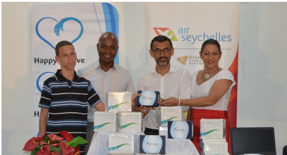
70 hearings were purchased from loyalty points given by customers

“In Seychelles there about 900+ more people who have hearing impairment. 400 people use hearing aids. And every year, we have about 5-6 new cases of children in need of hearing aids,”