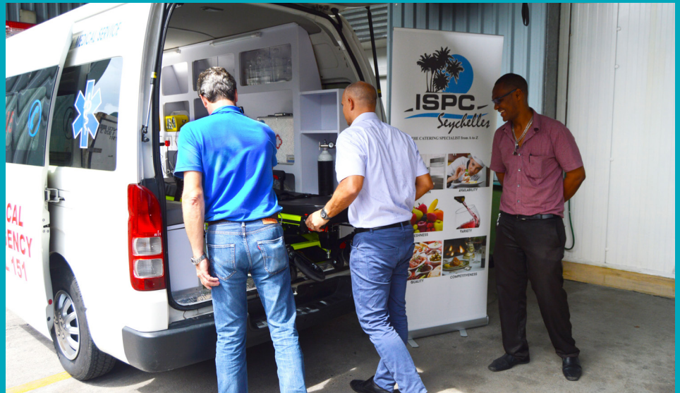
Minister Adam manoeuvres the new stretcher

The new stretcher will be used on a trial period of 12 to 16 months in hopes of soon equipping all ambulances with one. Minister Adam guaranteed that work is being done to standardise ambulances and the contribution from ISPC indeed facilitates it.