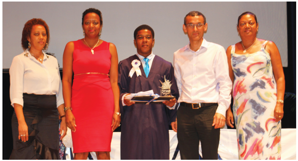
Student receives award

The graduates ended the ceremony with a pledge to practice their profession faithfully and with dignity so as to ensure the total health and well-being of their patient and client.