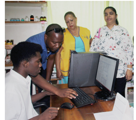
Computer being used in the pharmacy