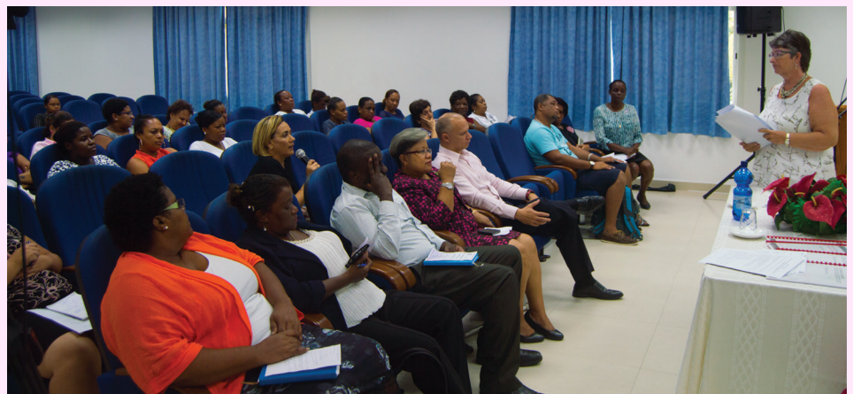
Participants had the chance to share their thoughts and ask questions

A new study will be conducted amongst pregnant women when programmes for maternity care have been altered to involve them more. The researchers hope this will reflect new results.