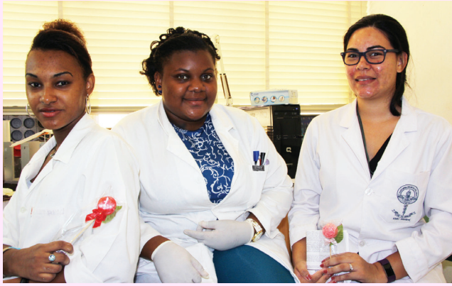
Ladies received roses

The hardworking women of the Ministry were brilliantly celebrated on Wednesday 8th March 2017 to commemorate Women's Day. Several small celebrations were organised within various sections culminating to a larger fête in the afternoon.