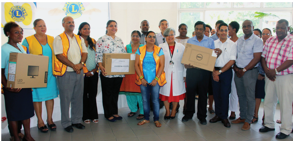
Souvenir photo at the ceremony

The English River Health Centre received an upgrade in a short ceremony held at the Health Centre, on Tuesday 28th March 2017.