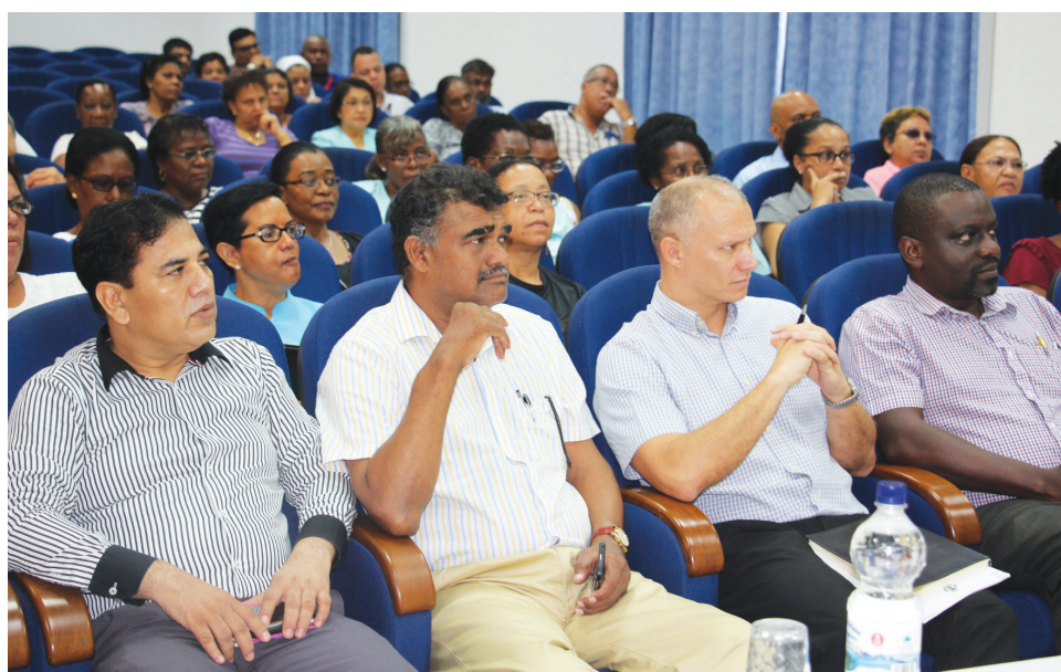
Participants listen to reviews from different entities of the Ministry