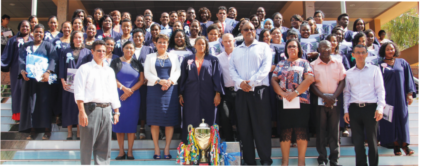
NIHSS graduates pose for souvenir photos on steps at ICCS

57 graduates from the National Institute for Health and Social Studies received their diplomas in a memorable ceremony held at the Seychelles International Conference Centre (ICCS) on Friday 10th March 2017 in front of proud friends, families and instructors.