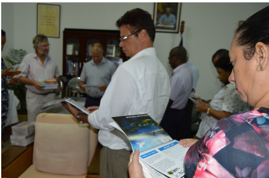
Staff view the calendars, admiring photos taken by fellow colleagues