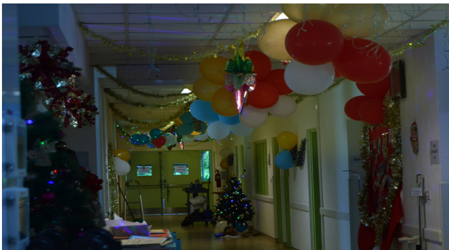
Beautifully decorated Hermitte Ward