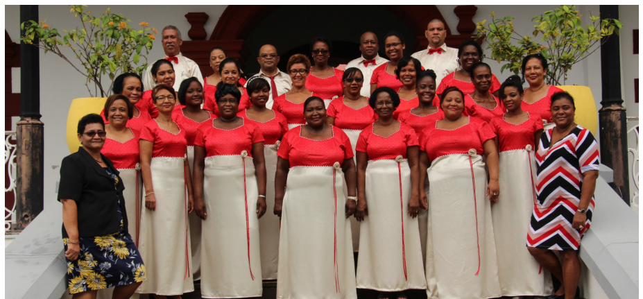
Health Department Choir on the front steps of the Red Roof Building before the competition