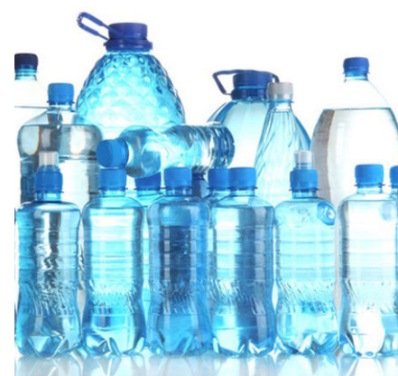
Various types of bottles used in the retailing of water

says that his team has set a proper timeframe to reach their set objectives which appropriately accommodate stakeholders.