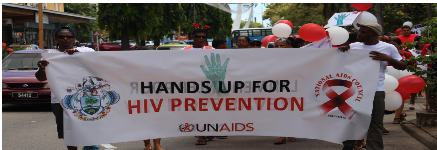
'Hands Up for Prevention' is the theme for World AIDS Day 2016

Commemorated under the theme "Hands up for Prevention", World AIDS Day 2016 was launched earlier this month on Thursday 1st December with a solidarity walk to show support for people living with the disease as well as remember those who have died from AIDS. The walk started at the Red Roof Building where participants gathered in red and white, then proceed along 5th June and Independence Avenues, to the St Paul's Cathedral in Victoria where a praise and worship ceremony was organised in memory of those who have passed away from AIDS.